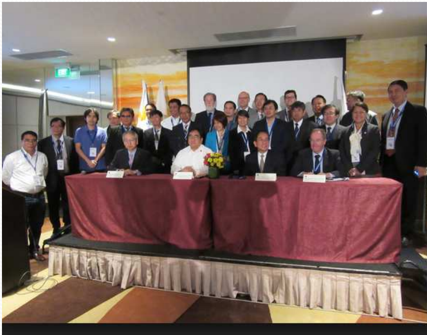
PPA Management & PIANC Officials