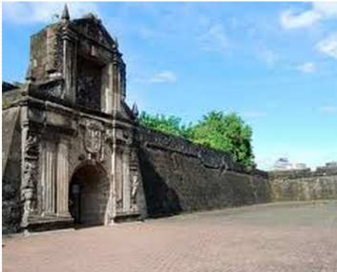
Intramuros City (Walled City)